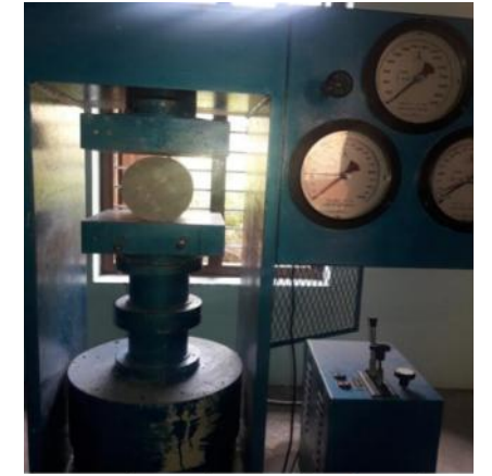
Fig.2.4 Compression testing machine for testing cylinder