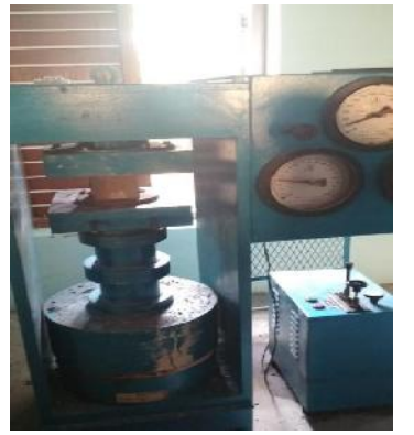
Fig.3.1 Compression testing machine