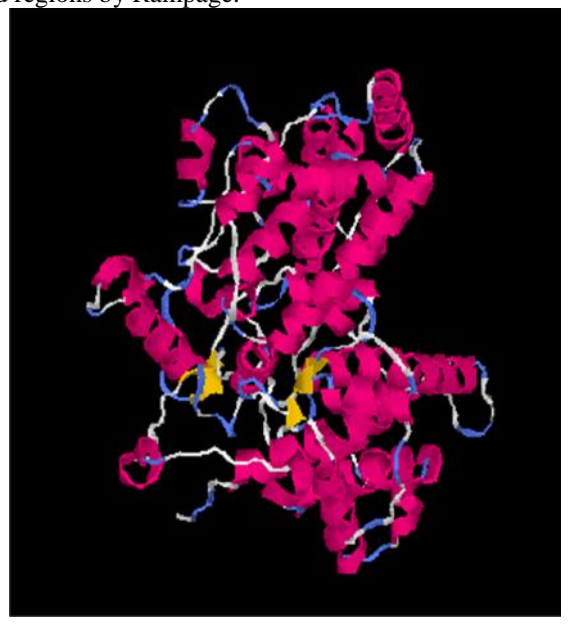
Fig1: Predicted structure of Gag polyprotein

through the optimization of the hydrogen-bonding network. The three dimensional structure is determined with the 89.8% of amino acids in favored regions by Rampage.